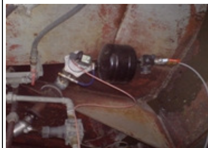
Current installation in Cemex

Cemex has ordered two more units of Aerovit shock-blast cleaning system. The units will be installed to keep pipes clean from deposits.